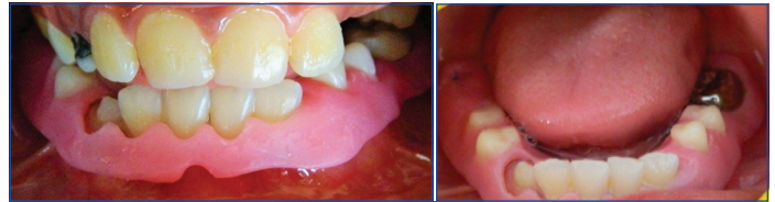
[Table/Fig-10]: Showing increased vertical dimension of occlusion with maximum intercuspation; [Table/Fig-11]: Showing cemented stainless steel crown with respect to mandibular permanent first molar (36) with Cu-sil like denture.

temporary acrylic crown on tooth #36 was then replaced with a permanent stainless steel crown [Table/Fig-11]. The patient was recalled for routine post-insertion check ups to monitor the erupting permanent teeth.