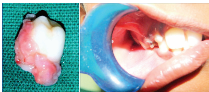
[Table/Fig-3]: Showing extracted mandibular permanent premolar (45) along with the epithelial lining attached to the tooth; [Table/Fig-4]: Showing decreased vertical dimension of occlusion with the upper right primary second molar and first permanent molar occluding directly onto the lower alveolar ridge.

denture was made with the opinion of prosthodontist. The upper arch showed decayed mobile right primary canine and erupting left second premolar. The first premolar was prematurely erupted. It was decided to extract the right primary canine under local infiltration followed by the Nance palatal arch space maintainer [Table/Fig-5].