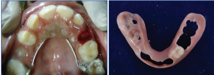
[Table/Fig-5]: Showing Nance palatal arch space maintainer with extracted maxillary deciduous first molar (54) and erupting maxillary permanent second premolar (25); [Table/Fig-6]: Showing Cu-sil like denture with vertical stop with grooves to accommodate the opposing tooth on the right side.

grooves to accommodate the opposing tooth. Nevertheless, there was a slight increase in vertical dimension which was favourable for the treatment. The extracted left first primary molar was replaced using an acrylic tooth in the Cu-sil like denture, which acted as a removable functional space maintainer [Table/Fig-6]. The dentures were then processed conventionally using heat cure acrylic resin with holes for the remaining natural teeth and flanges which fit accurately into the sulcus. The patient was recalled for routine post-insertion check ups to monitor the erupting permanent teeth.