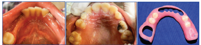
[Table/Fig-7]: Showing mandibular arch with Kennedy's Class II modification I situation; [Table/Fig-8]: Showing maxillary arch with mixed dentition with the presence of deciduous maxillary canine bilaterally (53,63) and left second molar (65); [Table/Fig-9]: Showing Cu-sil denture for the mandibular arch with holes to accommodate teeth.

The patient reported with no discomfort or any temporomandibular joint pain. Hence, this denture was considered satisfactory. The